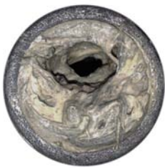
FIGURE 1 - Debris inside suction line builds over time.