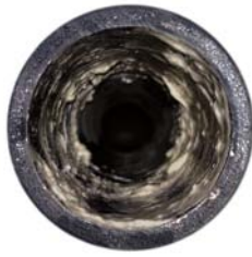
FIGURE 2 - Debris inside suction pipe after Bio-Pure Microbial Cleaning.