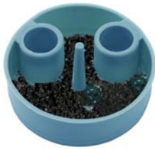
FIGURE 3 - Sludge, bacteria and debris in operator trap.