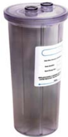
FIGURE 6 - Suction filter (after).