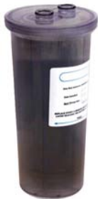
FIGURE 5 - Suction filter (before).