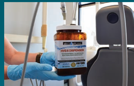
Connect suction handpieces and your system is Bio-Pure ready.