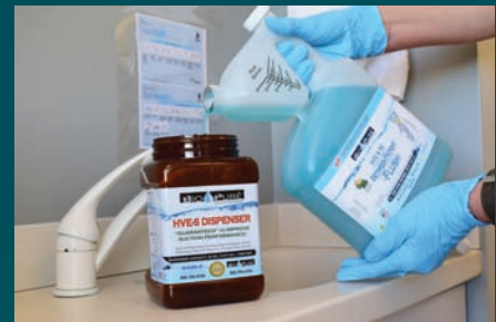
Add Bio-Pure liquid into dispenser