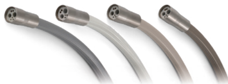
GRAY STERLING SURF DARK (WHITE) SURF SURF

Tubing can be substituted for different colours of equal value at no charge.