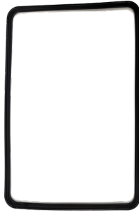
1700302 Statim Type 5000 Gasket Type Seal MSRP ..... $96.34 4+1* ..... $77.07