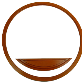
1700307 M11 Type Door Gasket with Dam MSRP ..... $136.47 3+1* ..... $102.35

On a daily basis we strive to provide premium quality products and services at value driven pricing to our dental dealers and their clients.