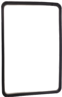
1700301 Statim Type 2000 Gasket Type Seal MSRP ..... $80.13 4+1* ..... $64.11